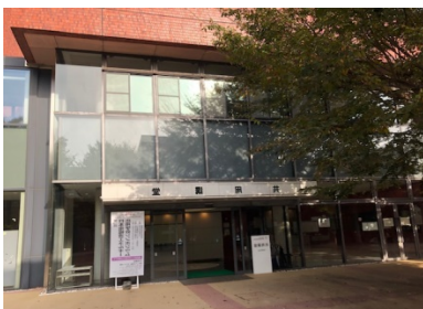
Symposium @ Kyoyo Kodo