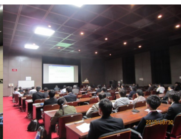
Room B (Oral)